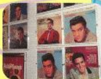
The Museum's Music Wall