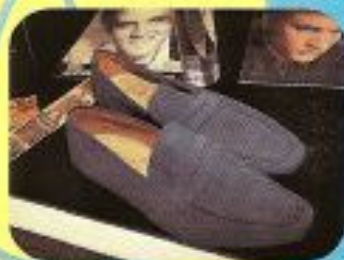
Elvis' Autographed Blue Suede Shoes