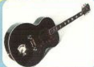
Elvis' Martin Stage Guitar